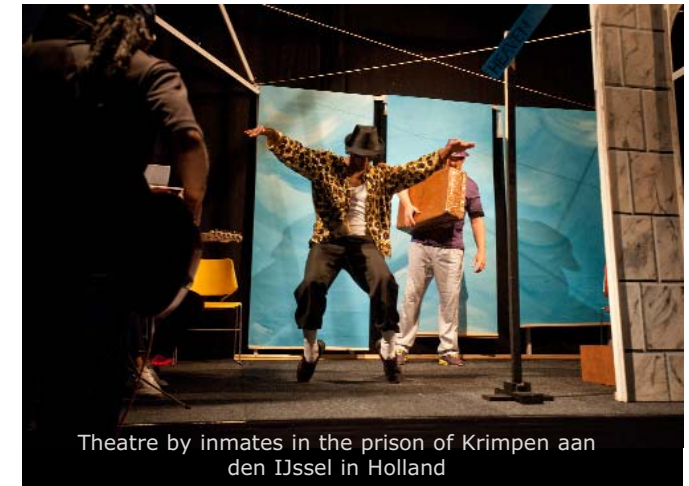
Theatre by inmates in the prison of Krimpen aan den IJssel in Holland

Is this beneficial to you and your profession? Then please tick YES on this link www.peetaproject.com and you will receive further information on the conference in a few weeks or contact us at teampeeta@peetaproject.com