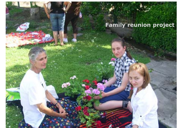
Family reunion project